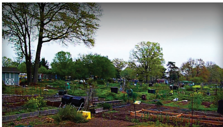
The Ft Barnard Community Gardens

a-Row' program to the Arlington Food Assistance Center (AFAC). FBCG was in the forefront of providing fresh produce to AFAC and started a movement where many other Arlington organizations followed suit. It is the premier Arlington County community garden and the one that county officials hold as a model for visitors. Several Douglas Park residents garden at FBCG and their lucky neighbors are recipients of fresh, home-grown vegetables.