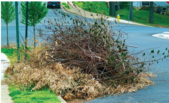
Keep the streets clear! Call 703.228.6570 to schedule brush collection.

A rlington County will collect unbundled brush (clippings and tree trimmings) and recycle it into wood mulch. Brush is collected the same day as your trash collection day. To schedule a pickup, call 703.228.6570, between 8am and 5pm, Monday through Friday (after hours select option 2). When making the request, please stay connected until you receive the confirmation message that will contain the scheduled date for your brush pickup. Requests made the same day of your trash collection day must be received by 6.30am to be processed for that day. You may also request a brush pickup online 24/7, by visiting www.arlingtonva.us and searching for 'brush pickup.' Please note that large quantities of brush resulting from the removal of more than two trees or land clearing will not be collected. Homeowners are responsible to arrange for disposal of these larger quantities of brush.