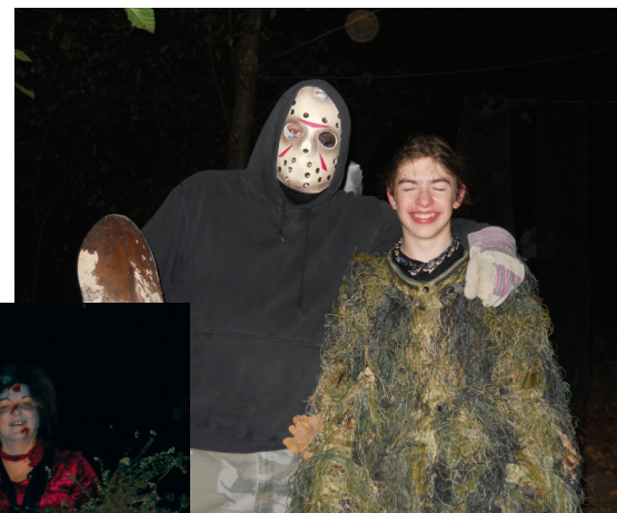
RIGHT: A gravedigger and moss-boy