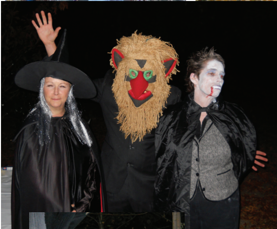
LEFT: The welcoming party