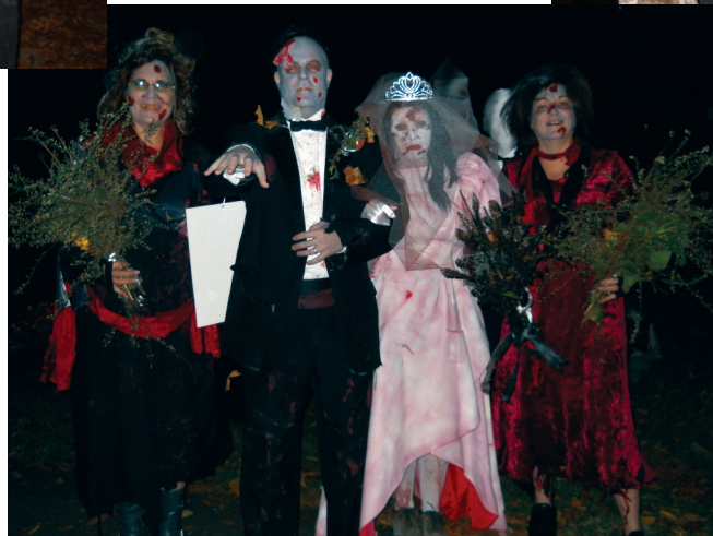
NEAR LEFT: A party of zombies are dying to meet you