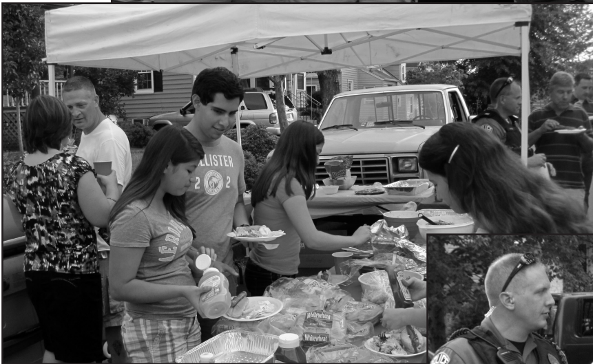
ABOVE: Plenty of food for all!