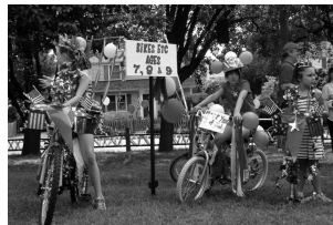
ABOVE: Gathering for the best-decorated bicycle competition at the 2009 parade.