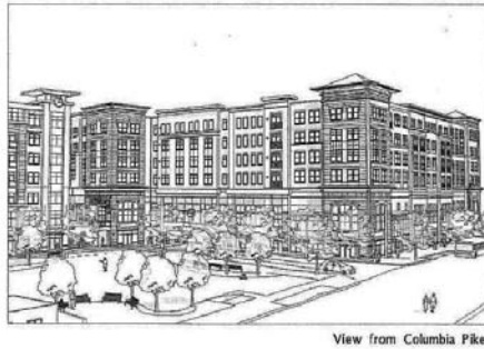
At right: A view of the final concept for Penrose Square as seen from Columbia Pike.