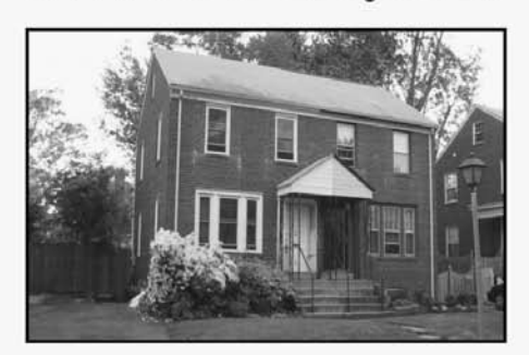
2742 Troy Street, South Arlington, Virginia 22206