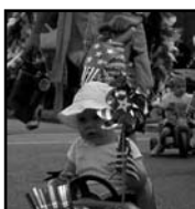
ABOVE: One of the younger parade participants.