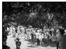
RIGHT: The neighborhood gathers at Monroe Park for the start of the parade.