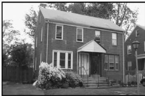
2742 Troy Street South Arlington, Virginia 22206