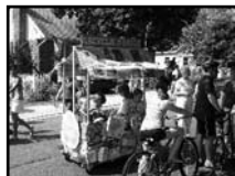
LEFT: The Recycle Mobile gets ready to roll.