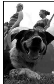
LEFT: Enjoying the show.

IS YOUR VIEW OF CHURCH "BEEN THERE...DONE THAT?"