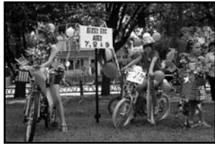
ABOVE: Gathering for the best-decorated bicycle competition.