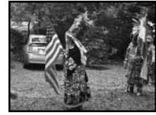
ABOVE: New this year was a demonstration of Bolivian dance by a troupe from Douglas Park. Here they prepare to start with a display of the United States and Bolivian flags.