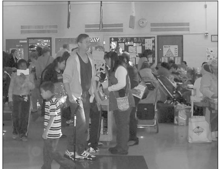
Randolph Fall Festival: Proceeds from the indoor yard sale will go toward the Randolph Fifth Grade Class Trip.

The Virginia Department of Transportation has formally approved a pedestrian crossing light across Glebe Road at 12th by the Post Office. Final design is being reviewed and construction could start by the end of the year. Data collection will start in the spring of 2007 regarding potential pedestrian crosswalks across Glebe at 14th St. and 16th St. The county will be collecting information on traffic and