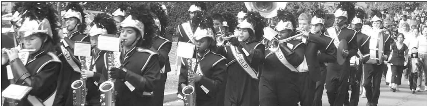
The Wakefield High School Band leads the Randolph holiday parade.