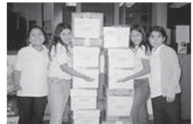
Randolph students pause with boxes they have packed to ship to Mississippi.

An envelope is provided in this newsletter. Please be generous!